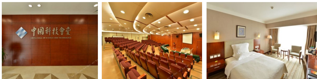
Hotel rooms at the China Hall of Science and Technology in Beijing

If you need to reserve the hotel in CHST, please contact APC2019 Secretary by email: psc@nigpas.ac.cn .