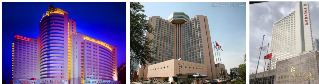
Other hotels near the congress venue: Guohong Hotel, Hotel Nikko New Century, Xiyuan Hotel

3) Xiyuan Hotel: Five-star garden business hotel, about 2.5 Km north of CHST; address: No. 1 Sanlihe Road, Haidian District, Beijing. Tel: 010-51655520; http://www.xiyuanhotels.com/