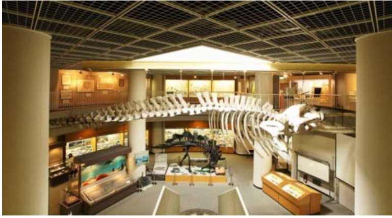
Regular exhibitions in Tohoku University Museum. Valuable collections of Department of Earth Science and Biology for 100 years.