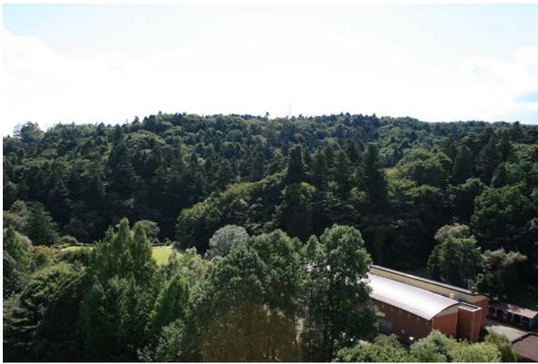
University Botanical Garden where the original forest has kept more than 400 years