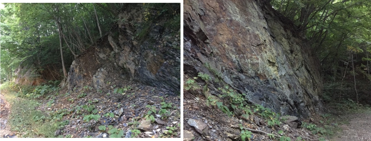
Pelagic sequence of the Permian chert to Lower Triassic claystone with the complete P-T boundary at the Akkamori section (Photo by Dr. Takahashi).

(Note! It is impossible to catch any international flights in 20th, June. You must arrange your hotel on 20th and your flight on 21st or later)