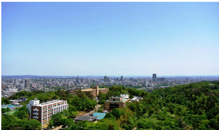
Sendai City from the Faculty of Science, Tohoku University (2015).

We invite you to attend the International Congress for the International Geoscience Programme 630 (IGCP 630) on the Permian – Triassic Climatic & Environmental Extremes and Biotic Response , to be held in Sendai, Japan, from Wednesday 14 until Tuesday 20 2017. We look forward to meeting in Sendai anyone interested on this topics and related study fields.