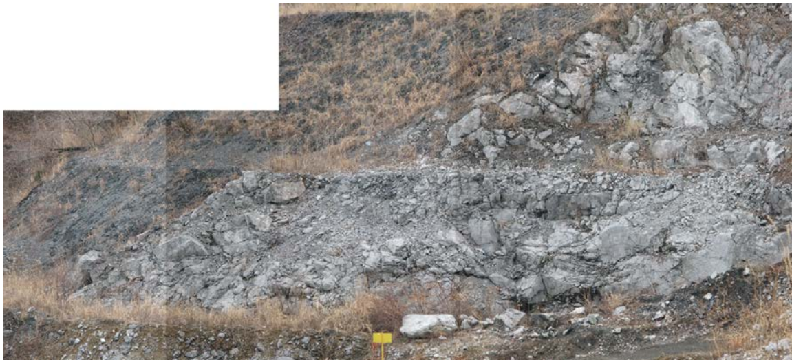
Nishiyama area in the Yoshizawa Lime Industry Co., the unconformable contact of the Jurassic deep-ocean pelagic radiolarian mudstones overlying the Permian fusulinid limestones of the sea-mount origin in the Panthalassa.