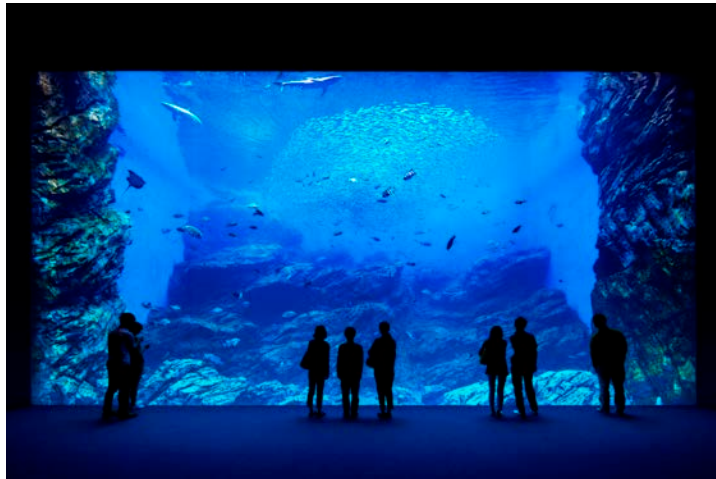
Umino-Mori Aquarium in Sendai City.

*This tour is guided by volunteers for foreign guests from the Sendai Tourism, Convention and International Association.