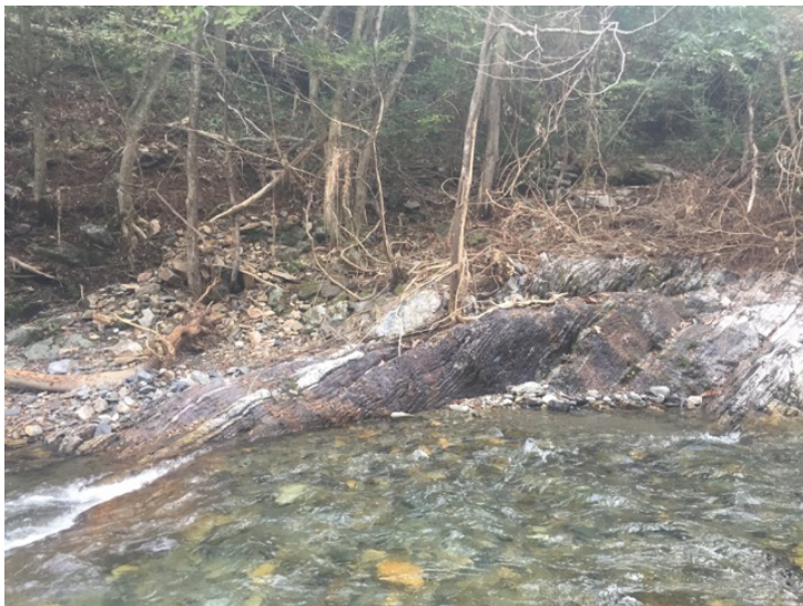
The Upper Carboniferous-Jurassic deep-sea chert at Otori. The approximate base of the chert sequence in the Jurassic accretionary complex of the North Kitakami Belt.