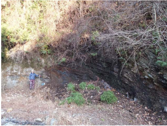
Ohgama section, Olenekian and Anisian siliceous mudstone and bedded chert sequence.

14: 30 End the excursion at JR Utsunomiya Station